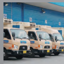
<Food & Beverage>