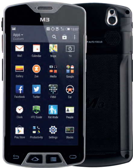
Android 4.3 Jelly Bean