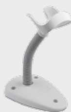
• STD-QD24-WH Stand, White