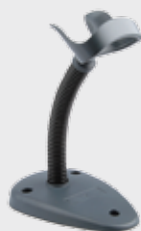
• STD-QD24-BK Stand, Black