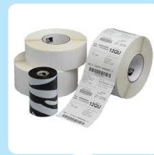
Consumables (labels, ribbons, PVC cards)