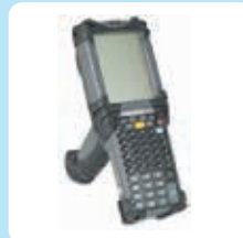
Data terminals & PDA