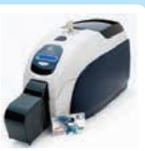
PVC card printers