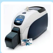
PVC card printers