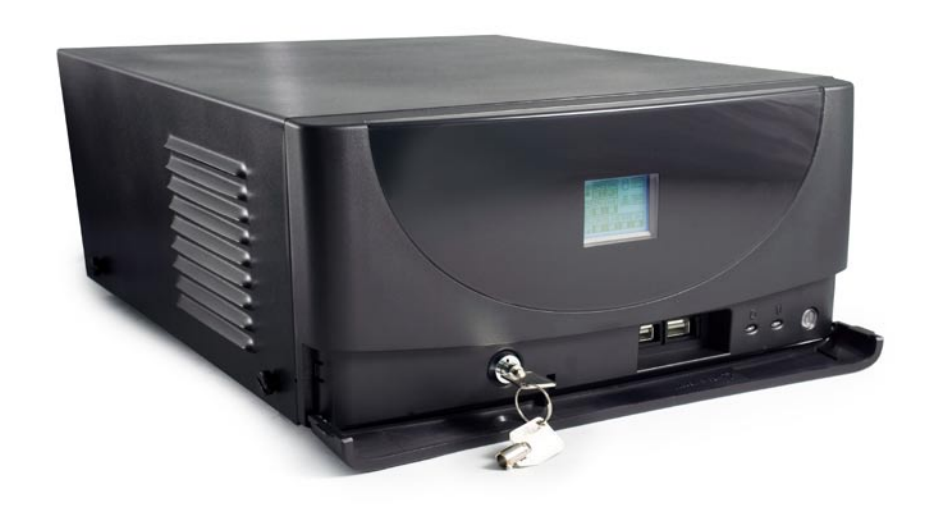
A high-performance PC platform for all Retail applications and environments

With compact dimensions, this POS system is sturdy, safe, reliable, long-lasting and easy to maintain, at home in both "front office" environments (cash desk) and in the "back office" (where it can be used as a server for example). Its 1.6mm-thick reinforced steel base-frame ensures optimum rigidity.