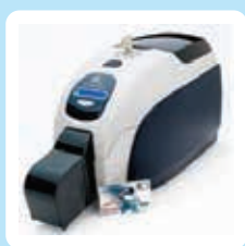
PVC card printers