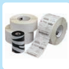
Consumables (labels, ribbons, PVC cards)