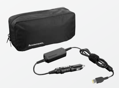
Lenovo® 65W DC Travel Adapter