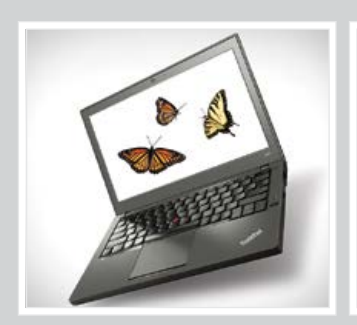
THE ULTIMATE ULTRAPORTABLE 20.3 mm (0.79") thick and weighing under 1.36 kg (3 lbs)