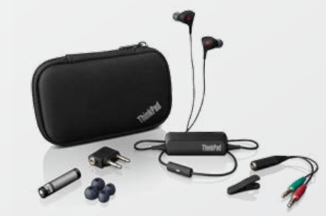
ThinkPad Noise-Cancelling Ear buds