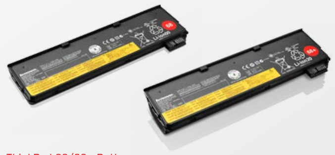
ThinkPad 68/68+ Battery