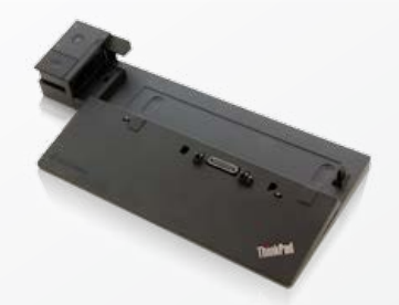
2013 ThinkPad® Docking: ThinkPad Ultra Dock, ThinkPad Pro Dock and ThinkPad Basic Dock